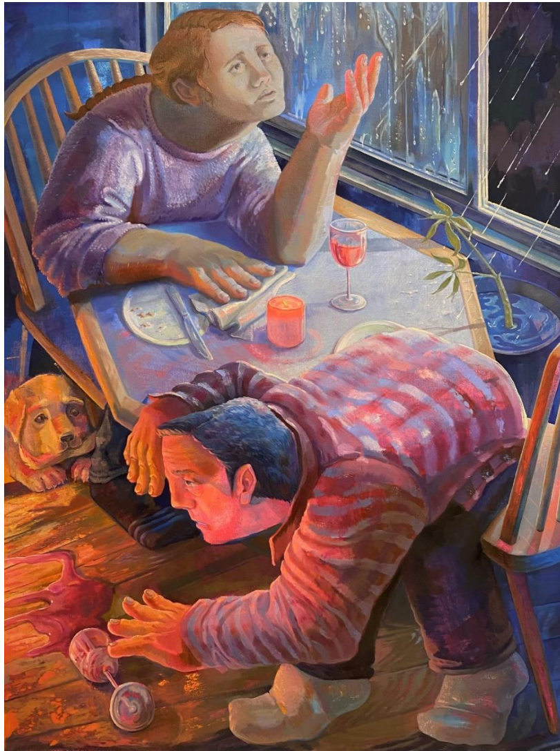
Erin Milez, Wine Down (The Magician) , 2022, Oil and acrylic on canvas, 121 x 91 cm