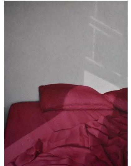
Ivana Štulić Morning